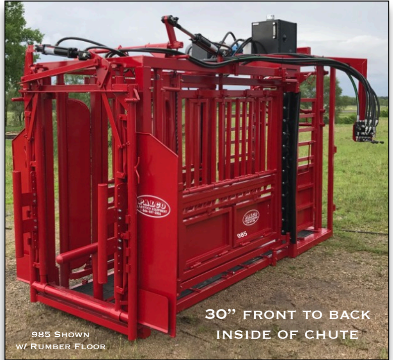
985 SHOWN W/ RUBBER FLOOR