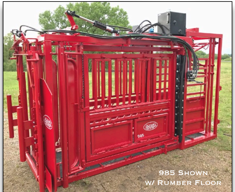
985 SHOWN W/ RUBBER FLOOR